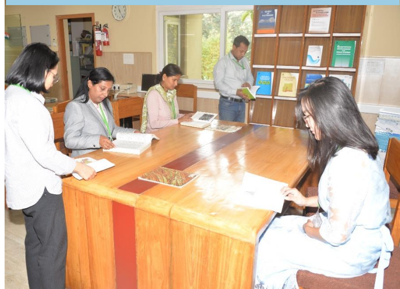
CSSTEAP participants in the Library