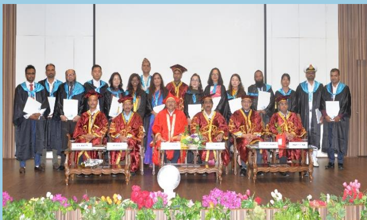
CSSTEAP participants passing out function