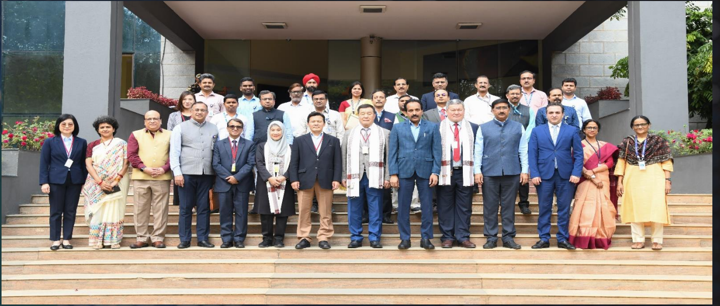
Governing Board Members and Special Invitees during 28 th Governing Board Meeting held on December 12, 2023