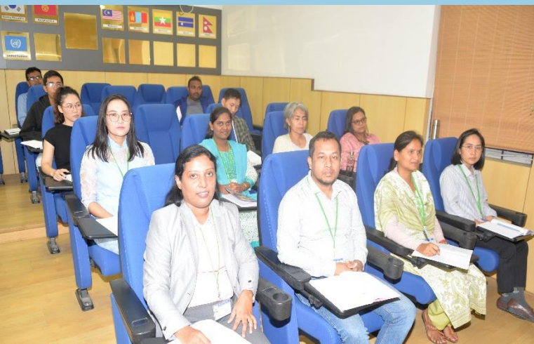
CSSTEAP RS & GIS Participants attending classes