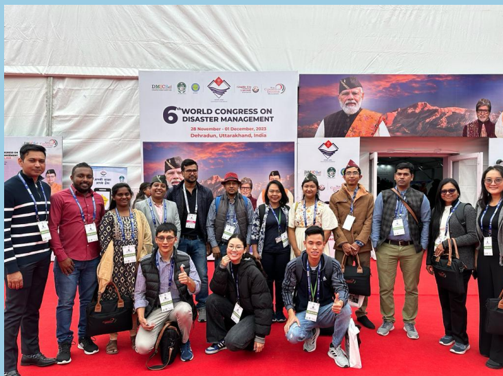
CSSTEAP participants attending Conference