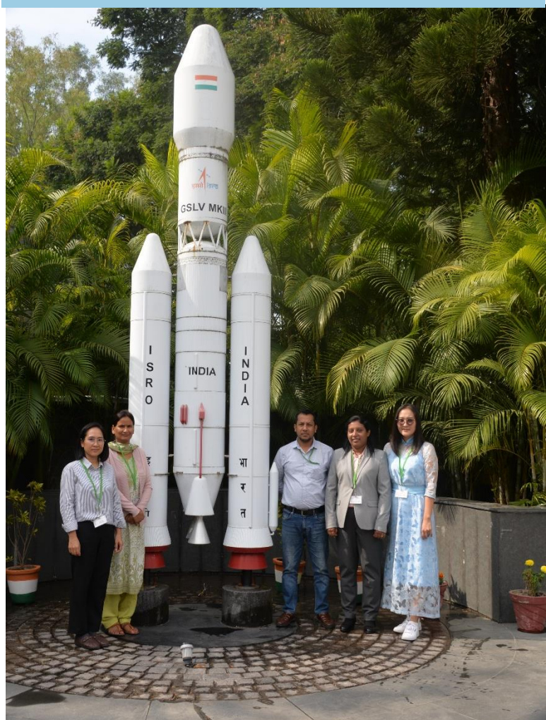
CSSTEAP participants at IIRS Campus