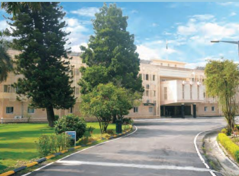
Indian Institute of Remote Sensing (IIRS) Campus, Dehradun