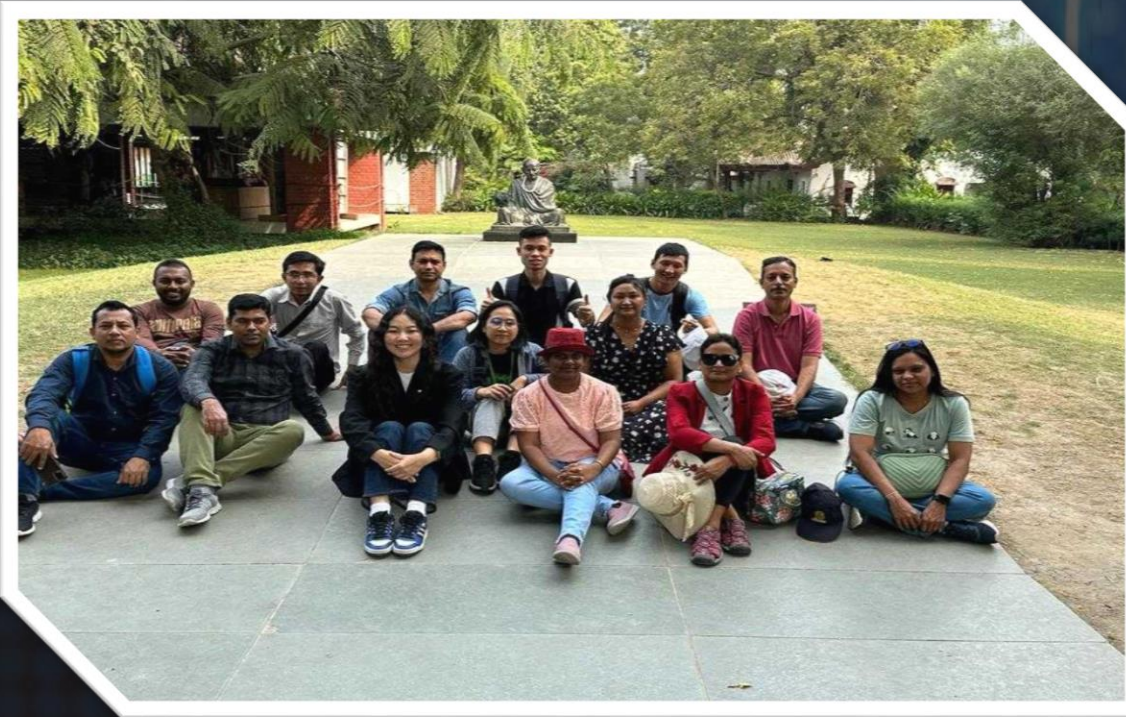
CSSTEAP participants visit to Mahatma Gandhi Ashram at Sabarmati, Ahmedabad, Gujrat