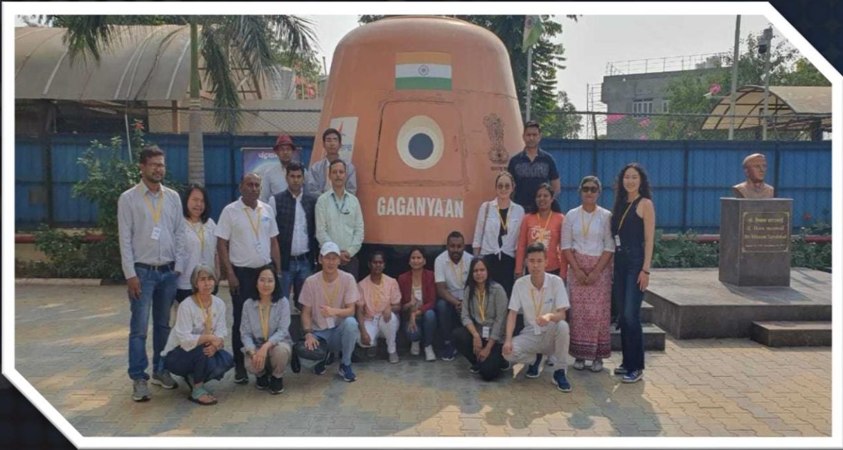
CSSTEAP participants visit to Vikram Sarabhai Space Exhibition Center, Ahmedabad