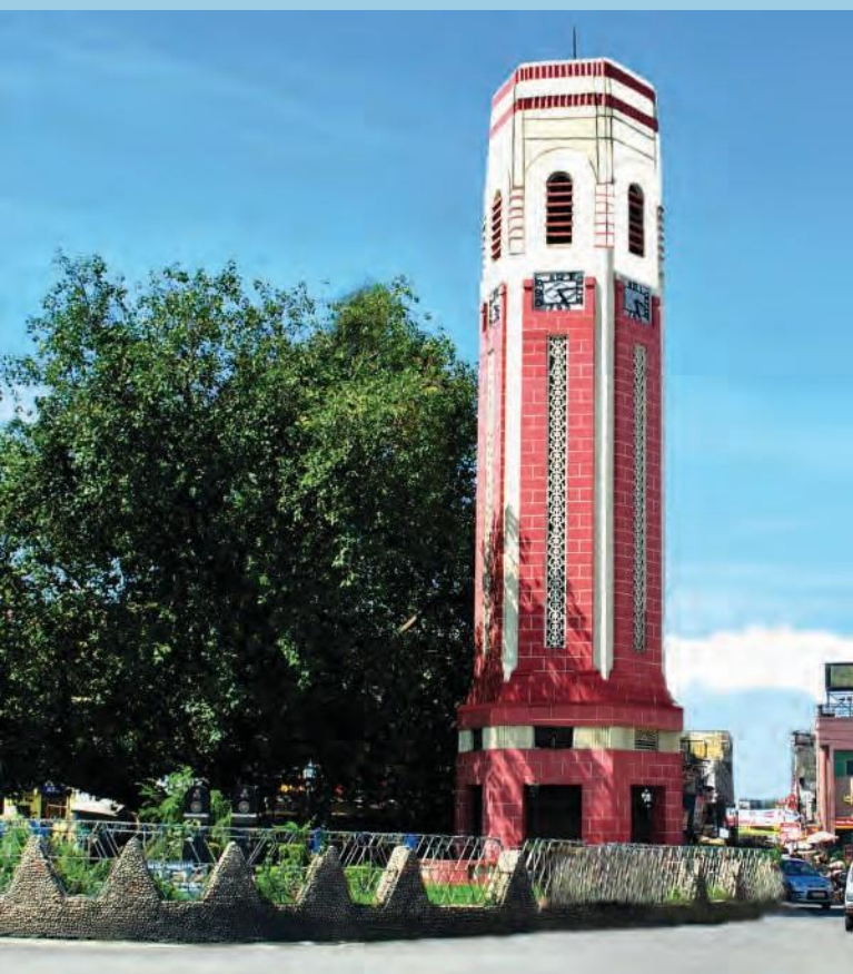
Clock tower landmark of Dehradun city.

Alumni meets are organized to develop a network and to establish meaningful linkages between CSSTEAP, faculty and its past students. These are aimed to provide common platform to interact and apprise about the latest development in the space technology and its applications. Such meets were held in Nepal, Bangladesh, Sri Lanka, Bhutan, Myanmar and Philippines in the past. The center proposes to hold 2-3 such meetings in coming years in different countries with local support.