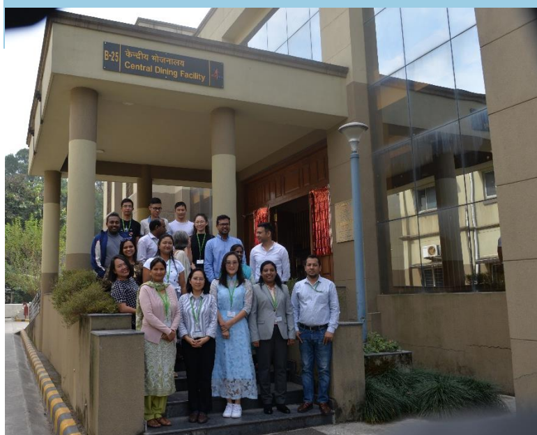
Participants of 27th RSGIS in the campus

(ii) Master programme: This programme gives an opportunity and continuity in developing higher research skills for those who have completed successfully the nine months P.G. Course. This is subject to qualifying for admission requirements of Andhra University, India. A research project by the scholars is conducted and executed in their respective countries with a view to transfer the technology in his/her organization. It will also be a test of the