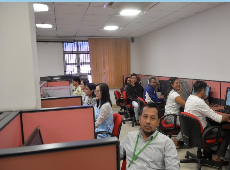
CSSTEAP participants in GIS Lab

Medical fitness certificate from Authorized Government medical officer covering status of Eye, Chest (Tuberculosis), Vaccinations, heart, lungs, liver, spleen, Hydrocele, skin & V.D., Hepatitis, HIV, Yellow fever and other contagious diseases be enclosed with the application form. In case if any information requiring medical attention is hidden and if found during the course, the Centre will be obliged to send the candidate back home any time. The travel cost will be borne either the nominating/sponsoring authority or by the candidate itself.