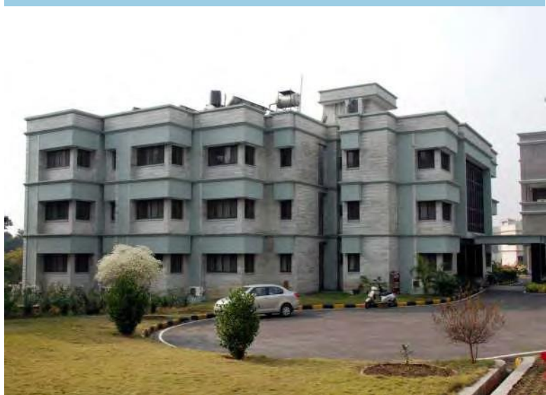
International hostel for course participants at IIRS Dehradun

Know more about CSSTEAP, its past and future programmes, list of participants and countries who have benefitted from these and the Pilot Projects carried out through these programmes, please visit us at www.cssteapun.org